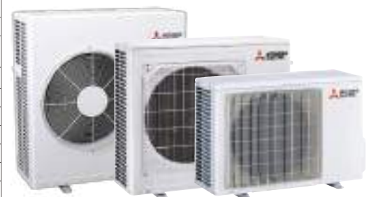
MSZ-AP71/80VG(D*) MSZ-AP50/60VG(D*) MSZ-AP25/35/42VG(D*)

(D*) represents DRED enabled model. This is only available in QLD. Multi-split system compatibility with model numbers MXZ-*E**VAD2-A1 only.